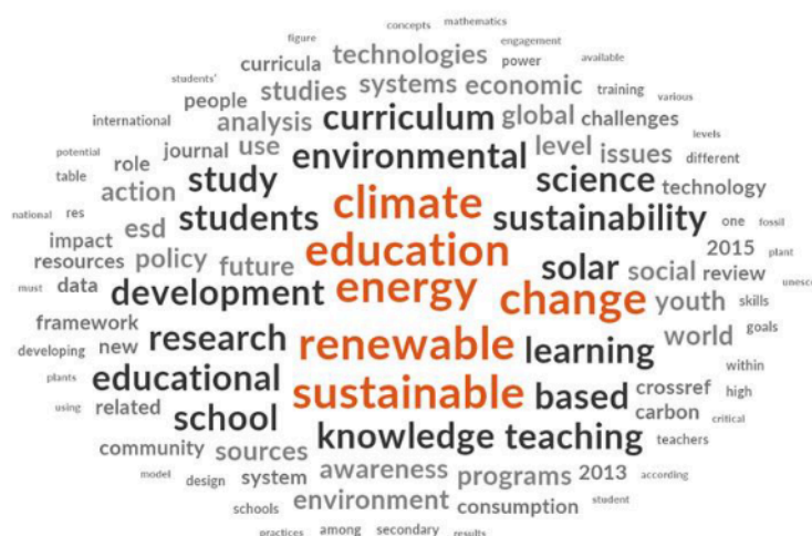
Figure 3. Article Analysis Using NVivo Word Cloud Method.

A meticulously organized KIR training program grounded in LCE is anticipated to significantly augment students' scientific abilities by incorporating the tenets of renewable energy and sustainability within their academic framework. A multitude of empirical research studies suggest that the execution of this program can enhance students' comprehension of renewable energy technologies, including photovoltaic systems, microgrid infrastructures, and low-carbon energy alternatives, whilst concurrently nurturing practical competencies through experiential learning and scientific projects centered on ecological solutions.