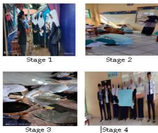
Figure 2. Stages of learning steps

Step three Solving the Problem (Develop and critique) that is, each group of origin makes a project that has been agreed upon and determined by all members of the origin group about the shape of the solar cell to be made. The last step is presenting the Product and Evaluation at this stage testing the solar cells that have been made and presenting the products made in front of the class. Other groups evaluate and provide input on the products that have been made by each group. Earning stages with the integrated PjBL model of science, technology, engineering, and mathematics with a jigsaw strategy can be seen in Figure 2.